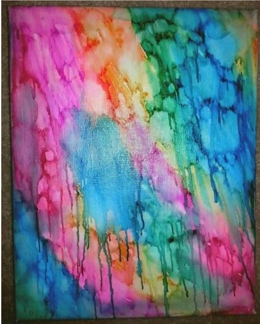
Pattern of colors, dripping alcohol at an angle