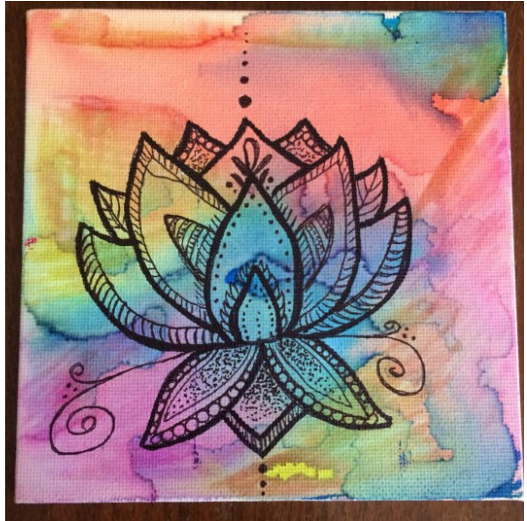
You can also draw a design over in black sharpie once it is dry.